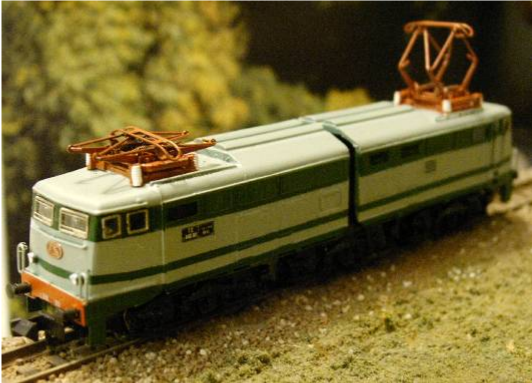
Figure 1: Manufacturer's Photo of the E.646.199

This article Copyright ©2009 by Blaine Bachman. You may download this article for your personal use and research. You may also make paper copies and distribute them to other individuals providing that the article is copied in its entirety, including the byline and bibliography, no fee is charged (except for nominal costs of reproduction), and this notice remains intact.