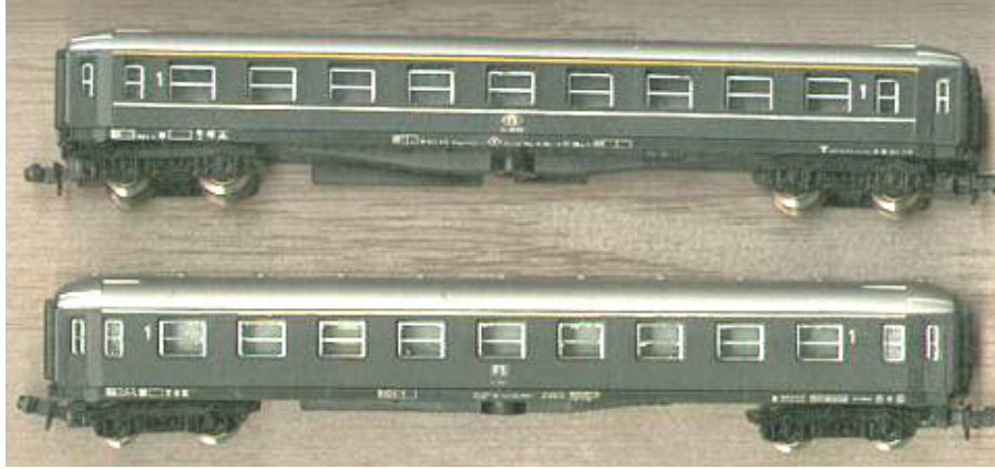
Figure 2 - Lima's 9-compartment Coach in Early (above) and Late (below) Paint

Oddly, only the postal car and the 9-compartment coach were produced in FS markings. It's interesting to note that the models have what appear to be double end doors with small round porthole windows as well as rectangular roof vents. Both of these features are characteristic of the UIC-Y cars, seeming to indicate that these shorter cars served as Lima's inspiration when developing these models. Another telltale sign is the football-shaped logo on the upper car in Figure 2; this early scheme was applied to some of the UIC-Y coaches when they first appeared in gray paint. It was soon replaced by the 'television' logo seen on the lower coach.