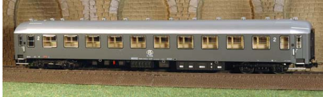
Figure 4 – Bz 45.799 in gray with early 'football' FS logo (HO scale)