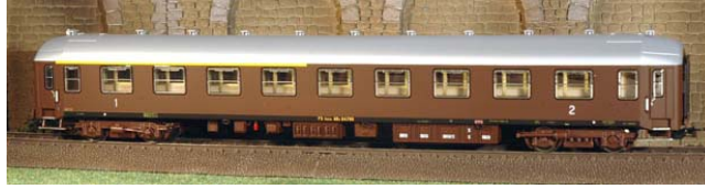
Figure 3 – ABz 64.799 in original Castano livery (HO scale)