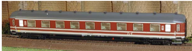
Figure 5 - Az in later 'Rosso Fegato' paint (HO scale)

A good match for the FS Slate Grey is Southern Pacific Lark Dark Grey